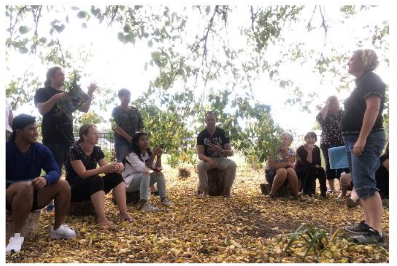
Strategic Goal 3