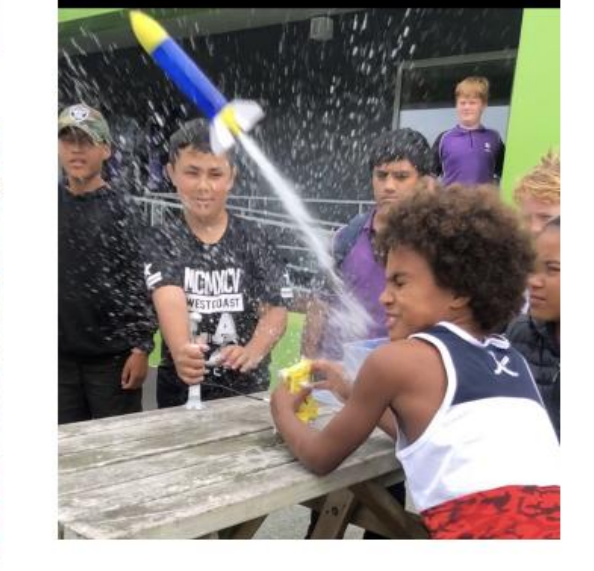
Strategic Goal 2