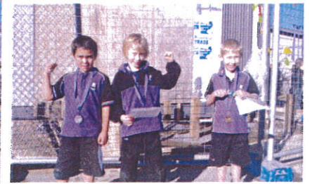
Year 2 Placegetters