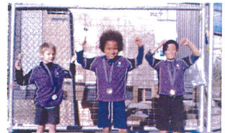
Year 4 Placegetters

In the last week of Term 2 we ran our Junior School Cross Country. Boys and girls from Year 0 to Year 4 participated and ran around the school grounds and Woolston Park. All the children involved tried their best and we were very proud of their efforts. First, second and third placegetters were awarded with a medal and certificates at our awards ceremony.