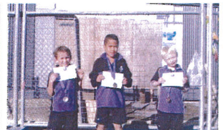
Year 3 Placegetters