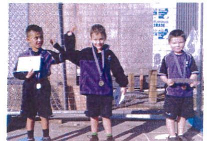
Year 1 Placegetters