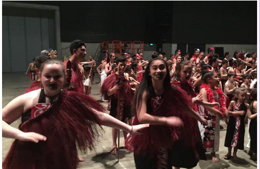
Waiting to perform backstage