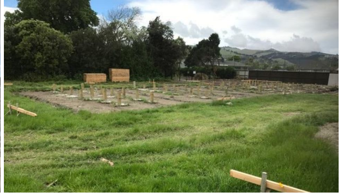
Part of the foundations for the new learning space

Due to the recent quakes, king tides and wet weather, the building site is full of water, so work was halted last week. The builders are, however, fairly confident we can still proceed with the proposed methodology and get the site dry, inspected and pour site concrete with the excavation team onsite later this week or early next week to excavate the Hall foundation beams.