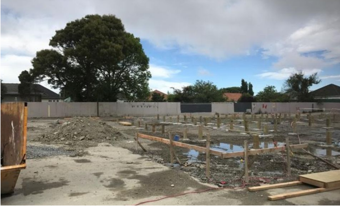
Foundations for the new multipurpose Hall