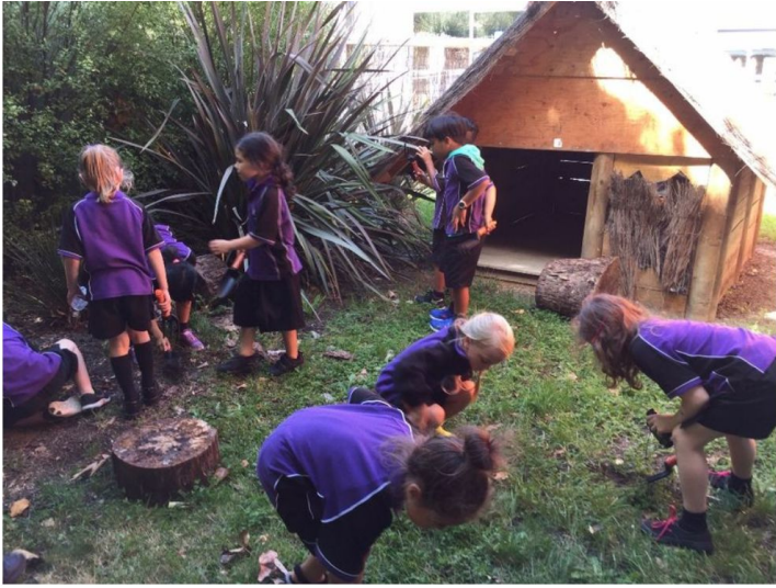
Team Pūkeko learning about the world around us and the insects that inhabit our garden.