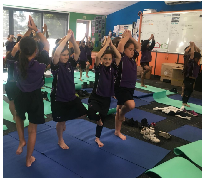
Yoga in Team Ruru