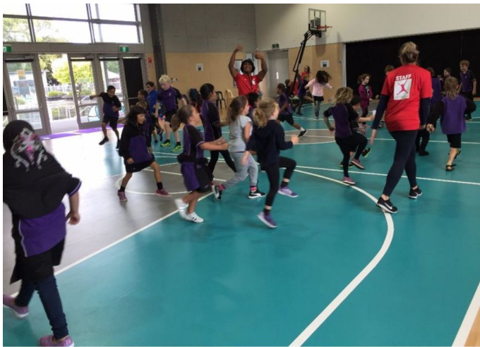
YouthTown P.E. Programme