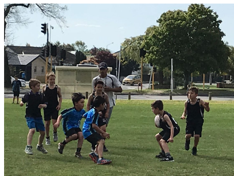
Year 3-4 Te Waka Tigers