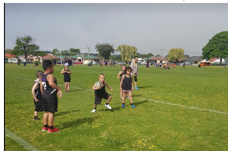
Year 0-2 Te Wakamons

Thanks to all the staff and parents who help to make this possible.