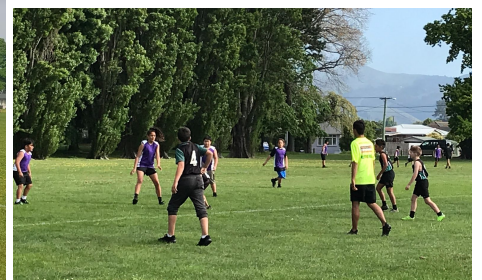
Year 5-6 Te Waka Purple