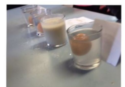
Glasses filled with flour, sugar, water and salt