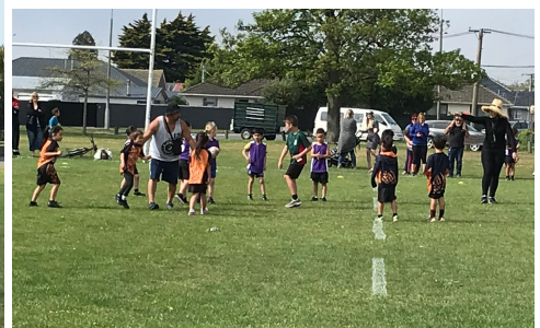
Year 0-2 Te Waka Leopards